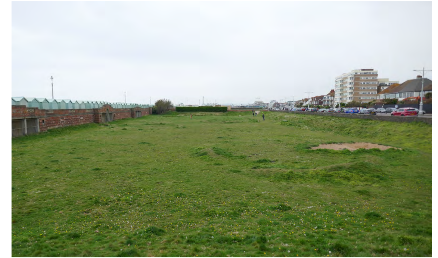
Existing bare amenity lawn of old Pitch & Putt space