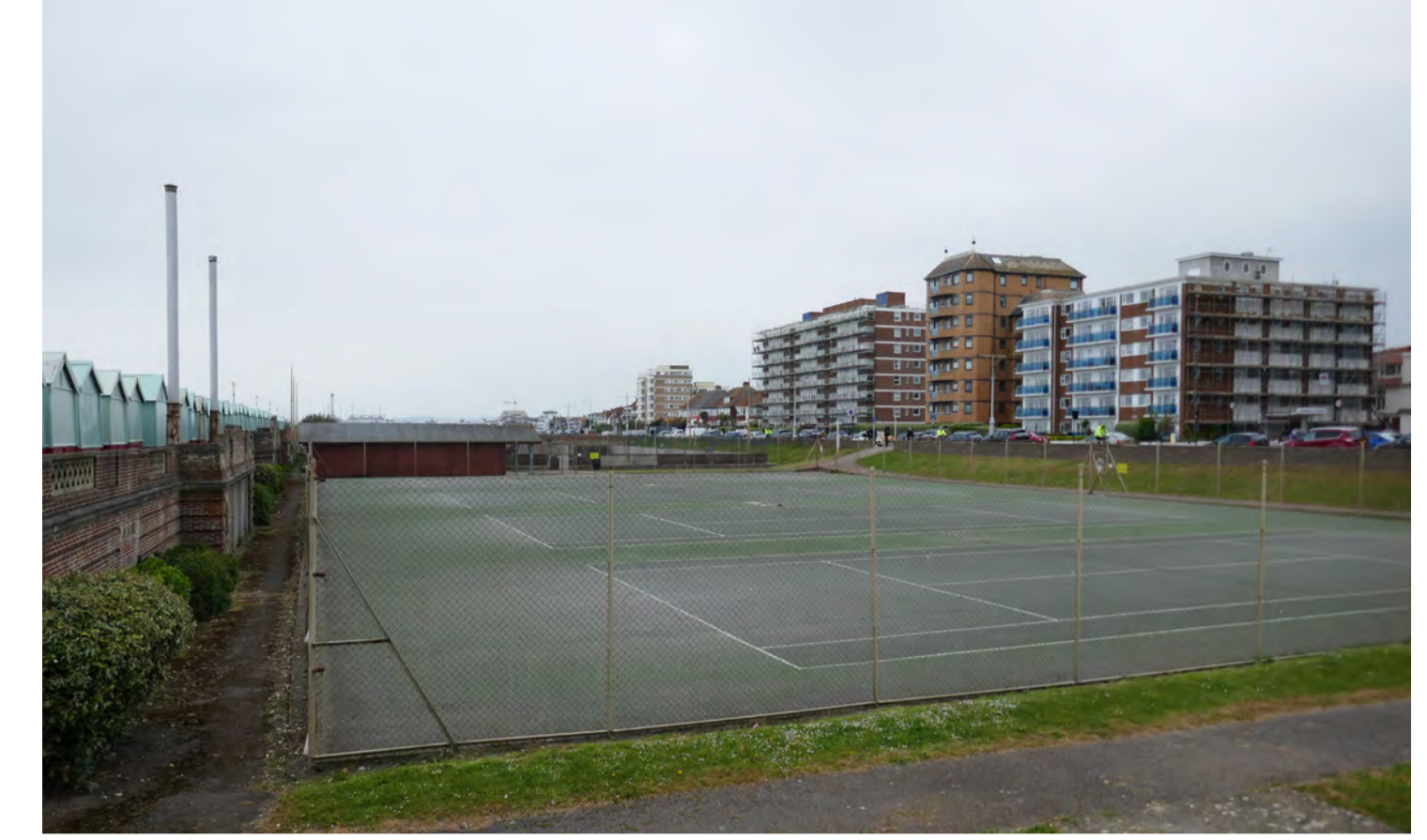
Existing western Tennis Courts area, showing accessibility issues