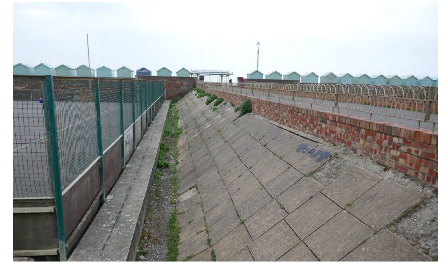
Existing MUGA facility contributes to inaccessibility of the site