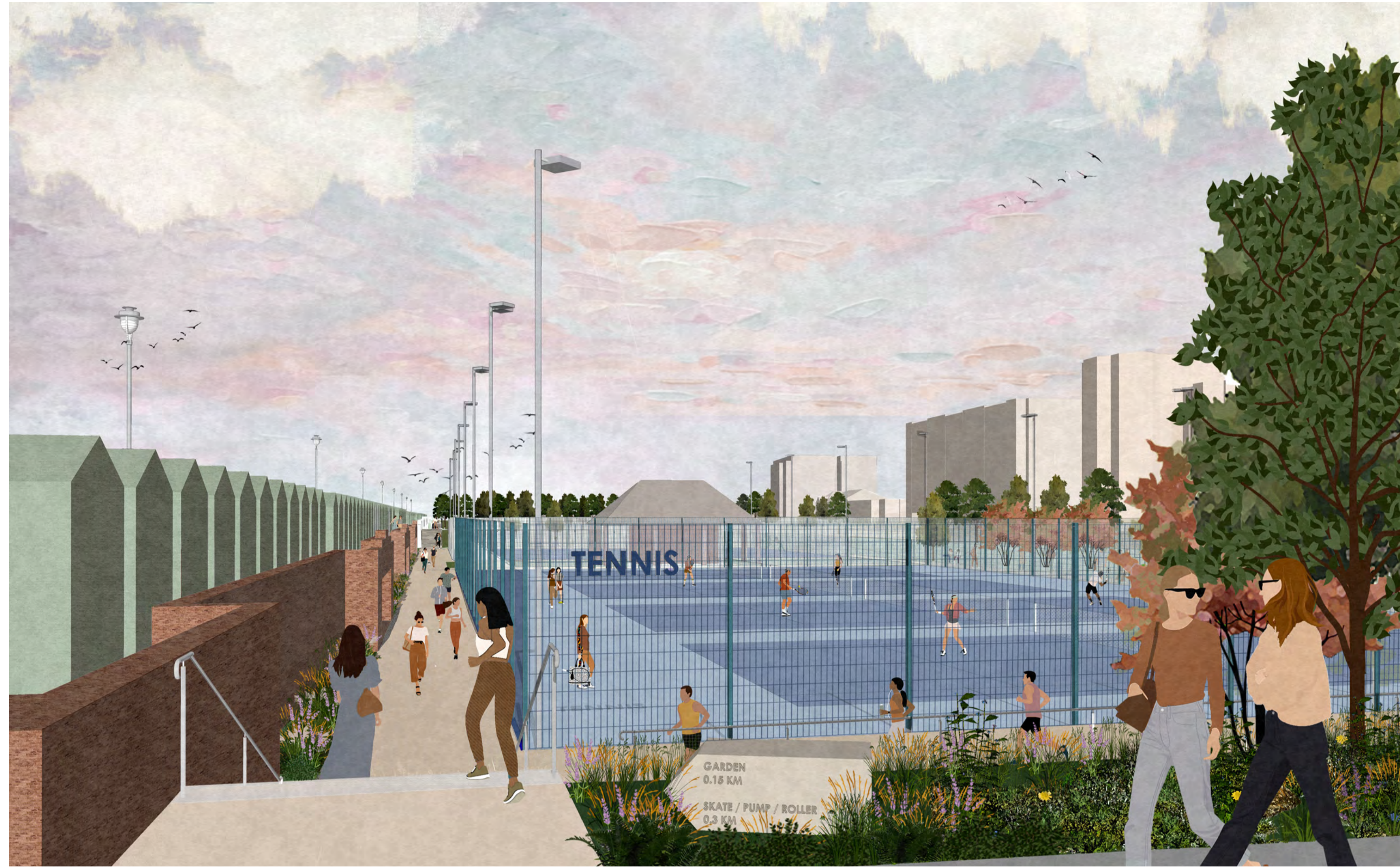
Artist's impression, view from east showing new Tennis Courts and the new accessible route through the Linear Park