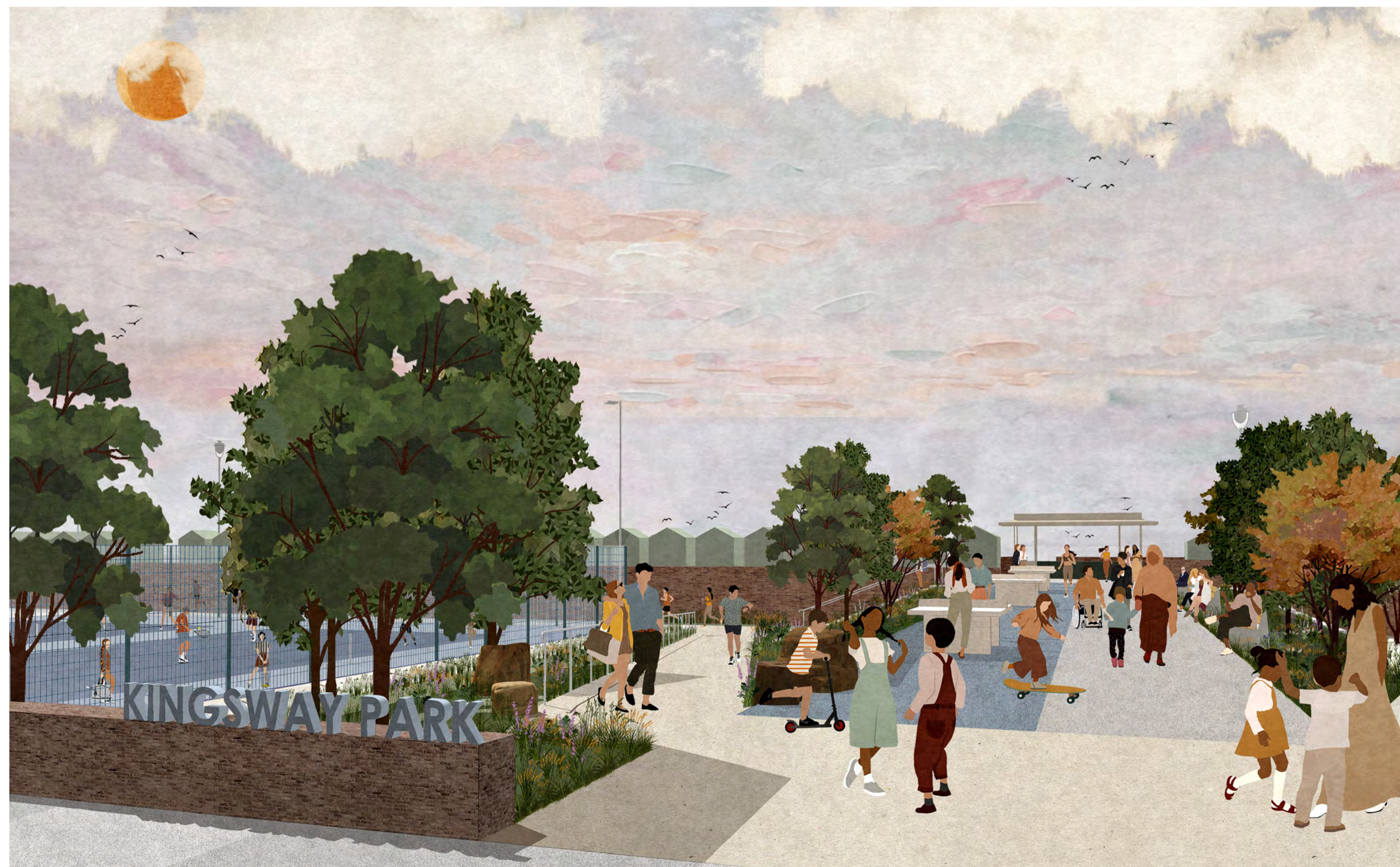
Artist's impression, view from north at Kingsway looking towards the Esplanade, showing park entrance with new amenities and ramped incline towards Tennis area